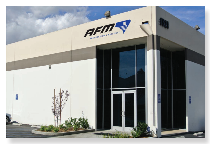
AFM – headquartered in Corona, California – is a single source supplier of all of your Shrink Sleeve Labeling needs.

In addition to our proven experience, our quality control procedures ensure that the product you receive will run on your equipment without issue. Uniquely positioned as a labeling equipment provider as well as a film supplier, we understand both ends of the production spectrum and assume accountability for the entire labeling application.