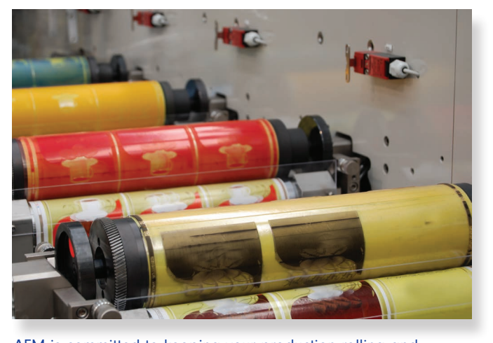
AFM is committed to keeping your production rolling and eliminating down time.